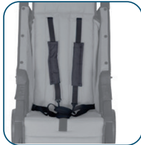
5 point belt