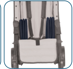
Side protective padding