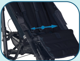
Seat width adjustable