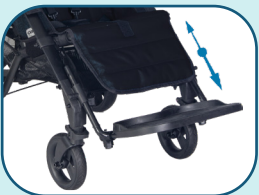
Fully height adjustable footrest