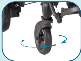
Front swivel wheels