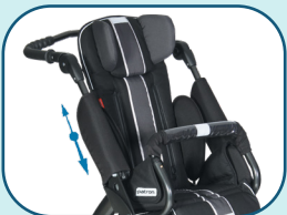
Backrest height adjustment