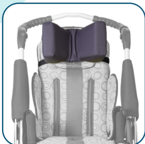
Side head cushion