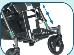
Footrest height adjustment