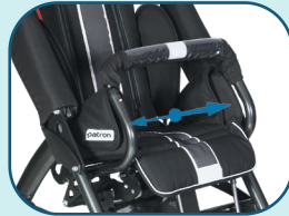
Seat width adjustment