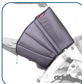
Padded frame cover with side protection