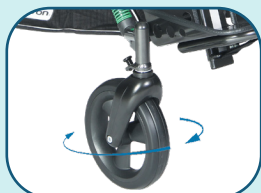
Front swivel wheels