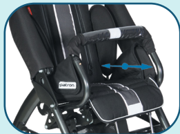
Seat depth adjustment