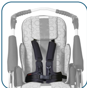
Belt 4 points