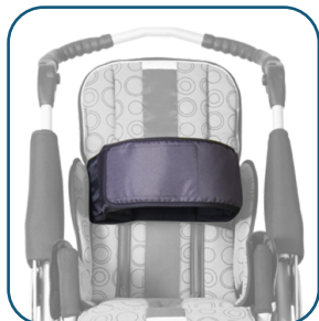
Chest immobilization belt