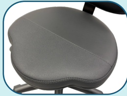
Profiled seat with non-slip strip