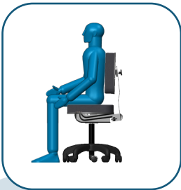
Seat at desk height