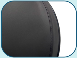
Industrial vinyl covering