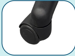
2" double nylon casters