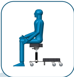
Seat at desk height