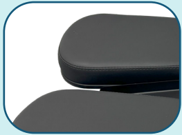
Industrial vinyl covering