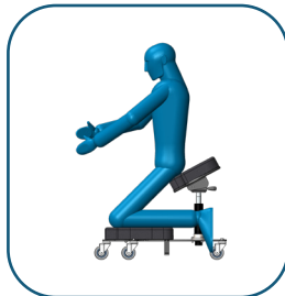
Kneeling in a seated position