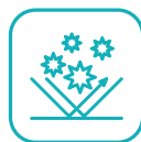
High abrasion resistance

1242 rue de Lanaudière Joliette (Quebec) Canada J6E 3P1