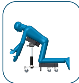
Kneeling in bib position