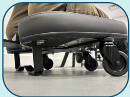
Knees pads with self locking brake