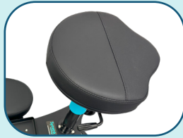
Profiled seat with non-slip strip