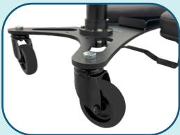
Steel base with 3" rubber casters (slow rolling)