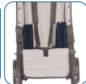
Side protective padding