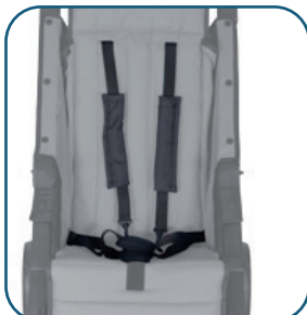
5 point belt