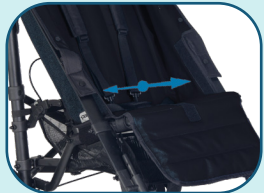
Seat width adjustable