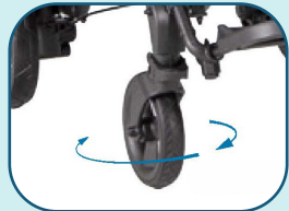
Front swivel wheels