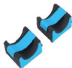
Foot support pillow