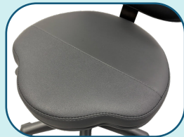
Profiled seat with non-slip strip