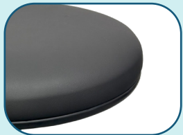
Industrial vinyl covering