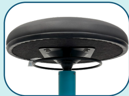
360° adjustment ring