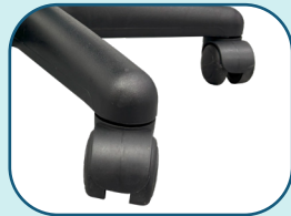
2" double nylon casters