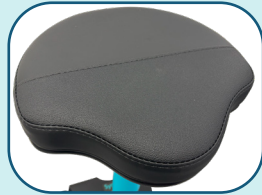
Profiled seat with non-slip strip