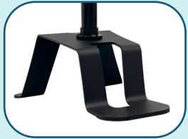
Industrial steel base with non-slip sole