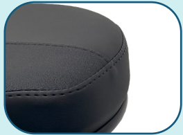
Industrial vinyl covering