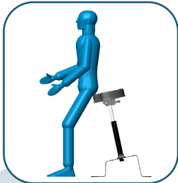
Sit-stand at a counter height